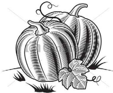
© Can Stock Photo - csp9276203